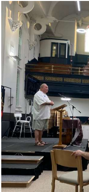
Chocolatier performing In Trinity Hall