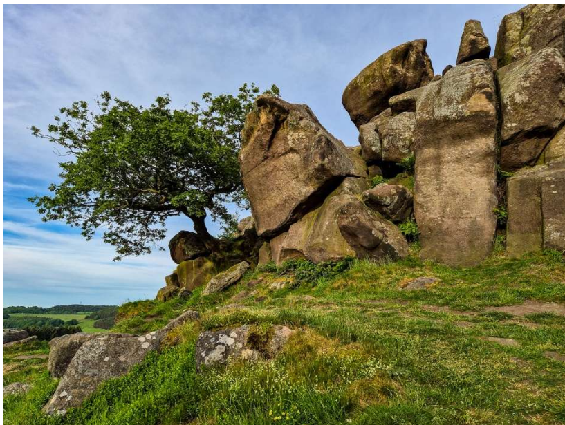
Robin Hood's Stride

Ashbourne, Brailsford, Kniveton, Kirk Ireton, Tissington, Parwich, Milldale