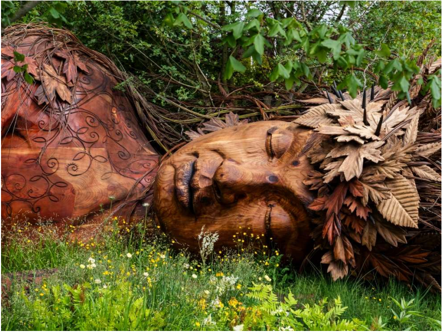
Mother Nature – a part of the winning display at Chelsea Flower show 2026