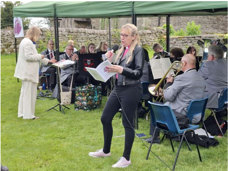
Songs of Praise at Tissington Well Dressings