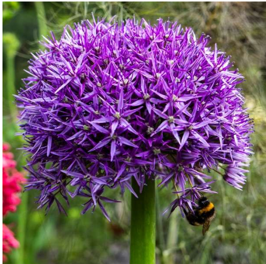
Allium and Bee