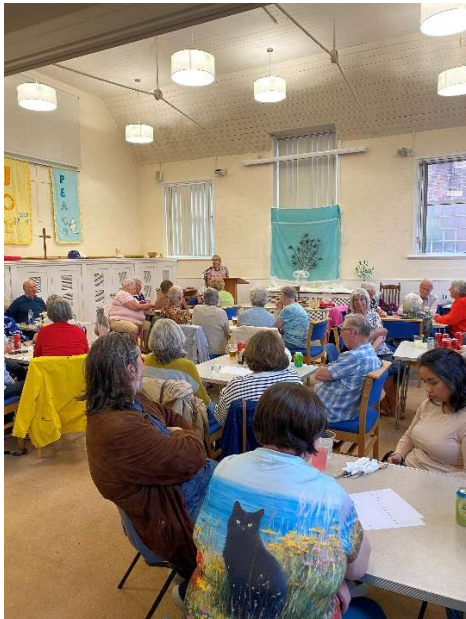
Quiz Night held at Brailsford