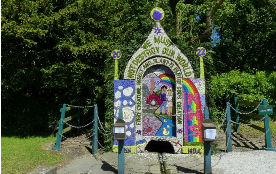
Tissington Well-Dressings 2022