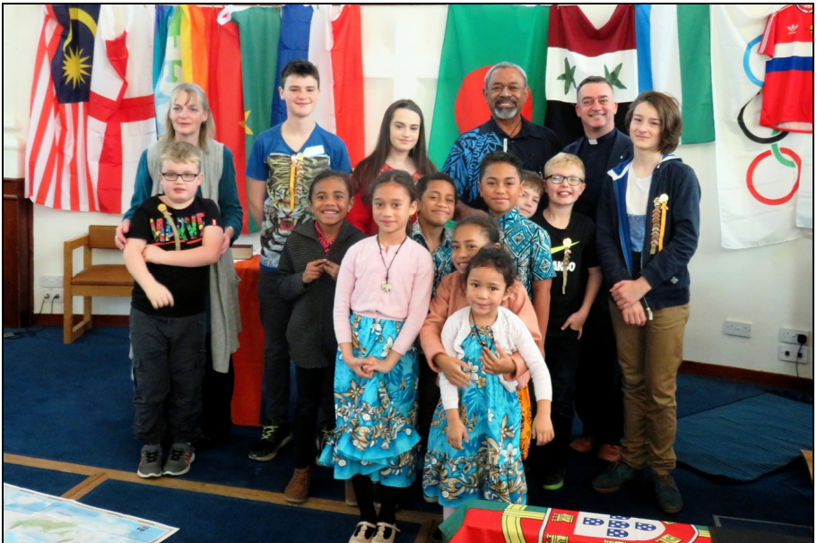
World Mission Sunday 2017 (see page 8)