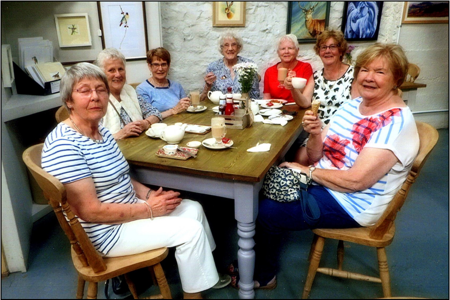
Hulland ladies doing what they do best – tea and cakes on their annual trip