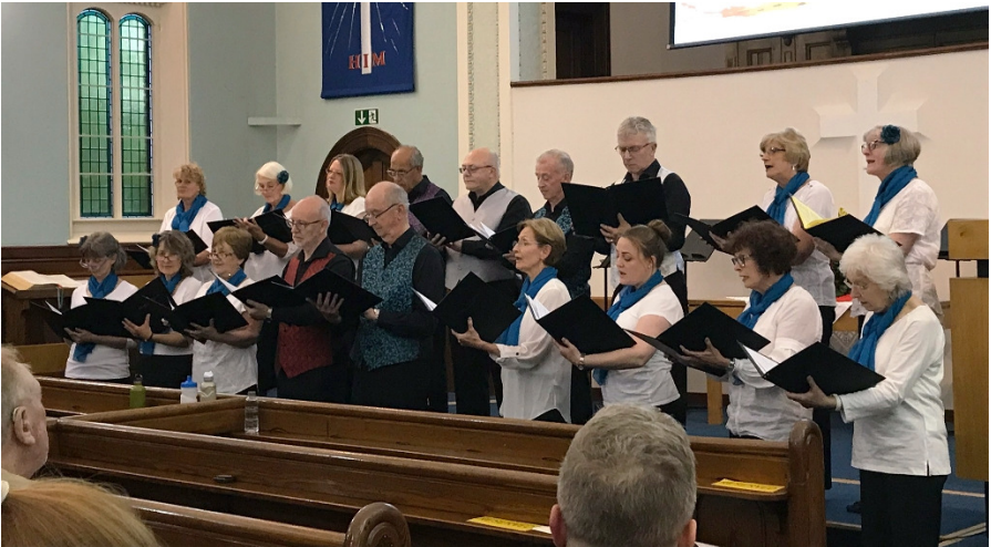
Rhythm of Life Concert on 8th June (see page 5)