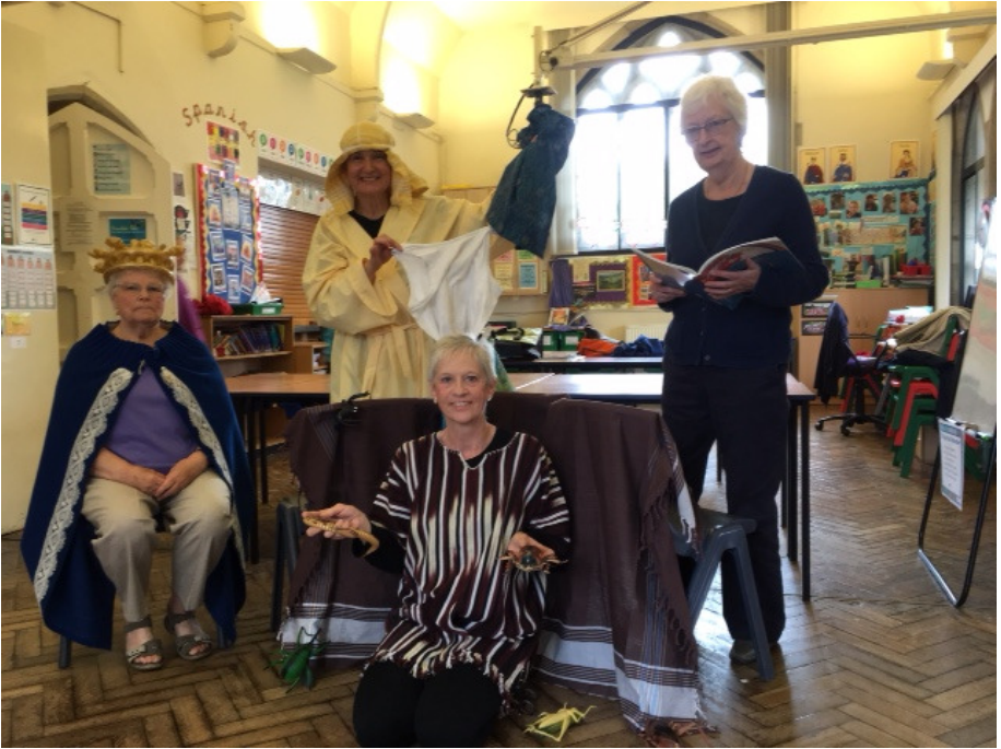
Open the Book story of Jeremiah down the well, at Ilam on 5th June