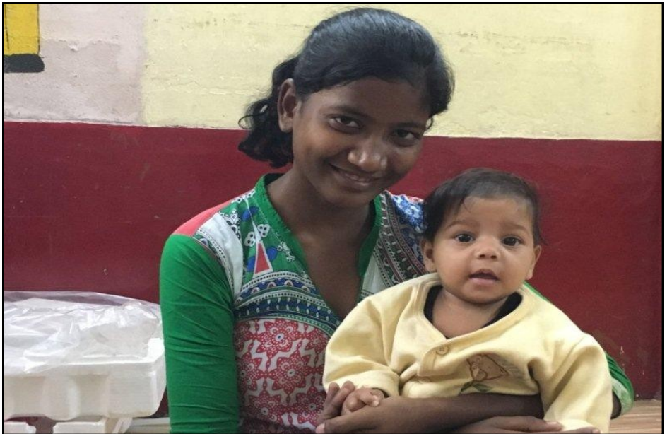
One of the older girls at the hospice with the youngest, six months old.