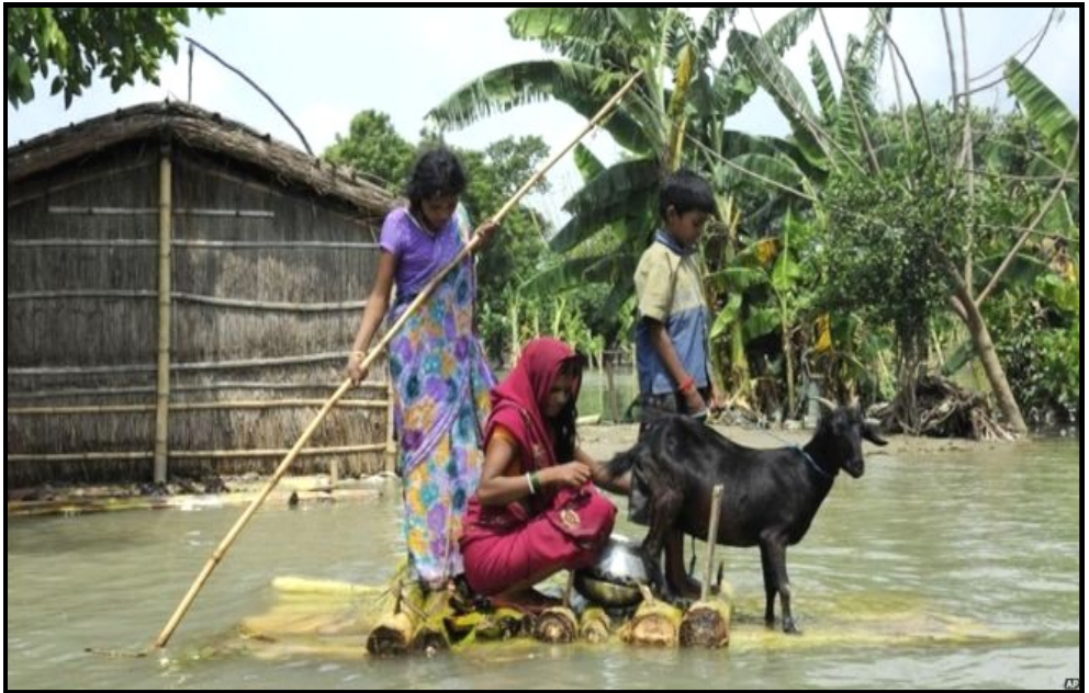
Floods in Bihar and Patna More than 500 people dead, many more made homeless See Mission Matters page 4