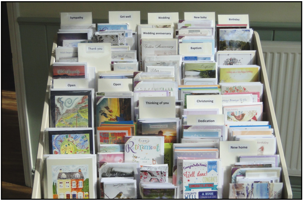
The Cornerstone Coffee Shop has an excellent choice of Christian Cards for that special occasion