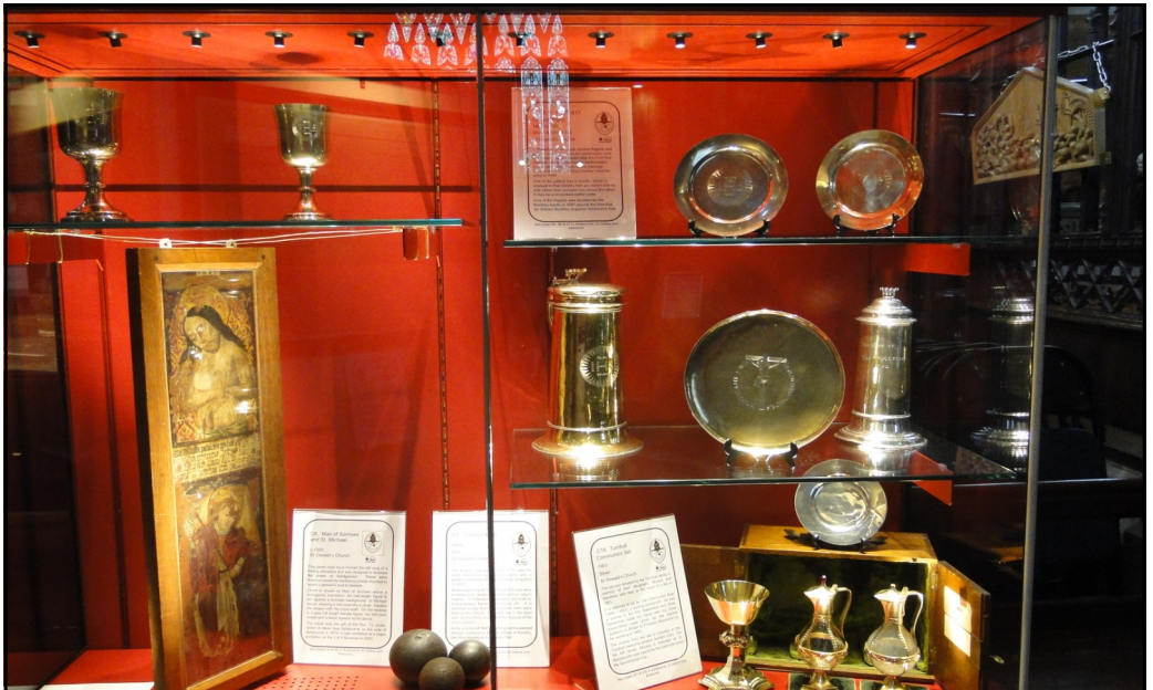
Some of the Ashbourne Treasures on display in St Oswald's Church, others may be seen at the Heritage Centre and the Library until September 27th.