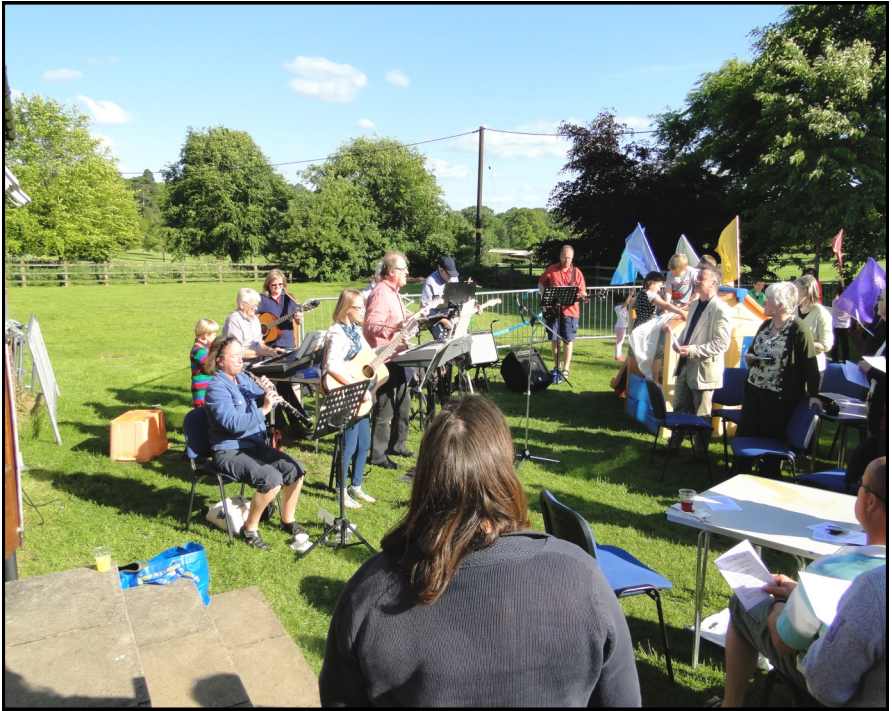
CIRCUIT BARBECUE AND WORSHIP - BRAILSFORD